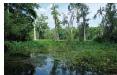
The Wakulla Spring in Florida has been acquired by Florida Forever Program and has become part of an ecological network.