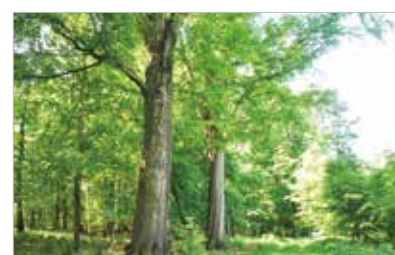
In the Free State of Thuringia, Germany, NGOs along with Federal and State Governments have been collaborating to restore more than 1,000 hectares of forest as a core area of an ecological network.