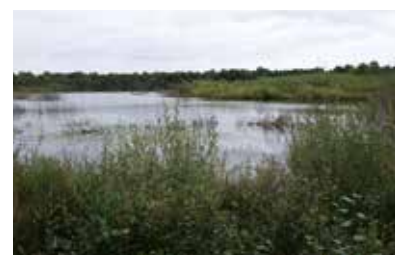
In England, the National Government has organized a competition for funds among local NGOs to encourage and assist creation of local ecological networks.